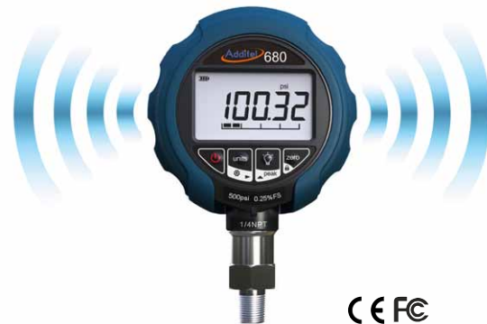
ADT-680 with data logging and wireless (optional)